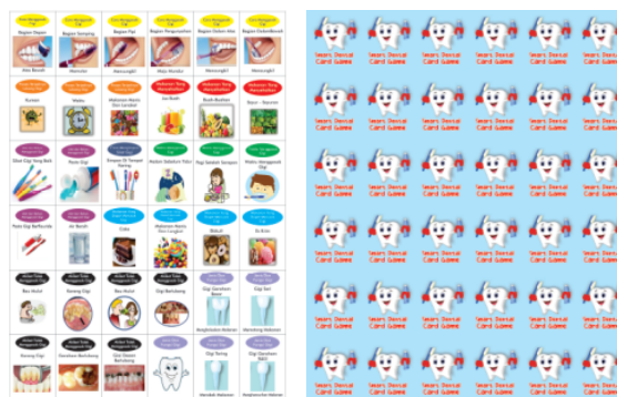
Picture 1. Smart Dental Card Game Model

The model's result is the Smart Dental Card Game Model, which is the output of learning media development about the maintenance of dental health in elementary school children.